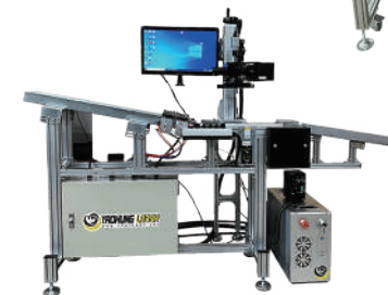
輸送帶+電腦視覺定位 Conveyor belt+ computer Vision