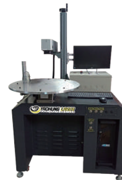
分度盤 Rotary indexing table