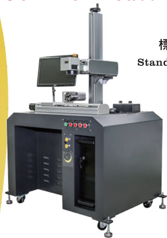
標準型基本款 Standard basic model