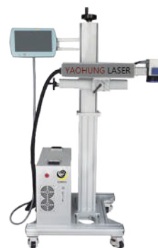
移動型機動式 Mobile model