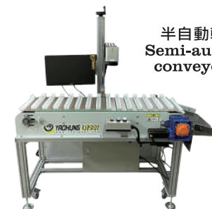
半自動輸送帶 Semi-automatic conveyor belt