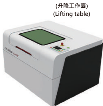
(升降工作臺) (Lifting table)

Lifting table, convenient thick material cutting.